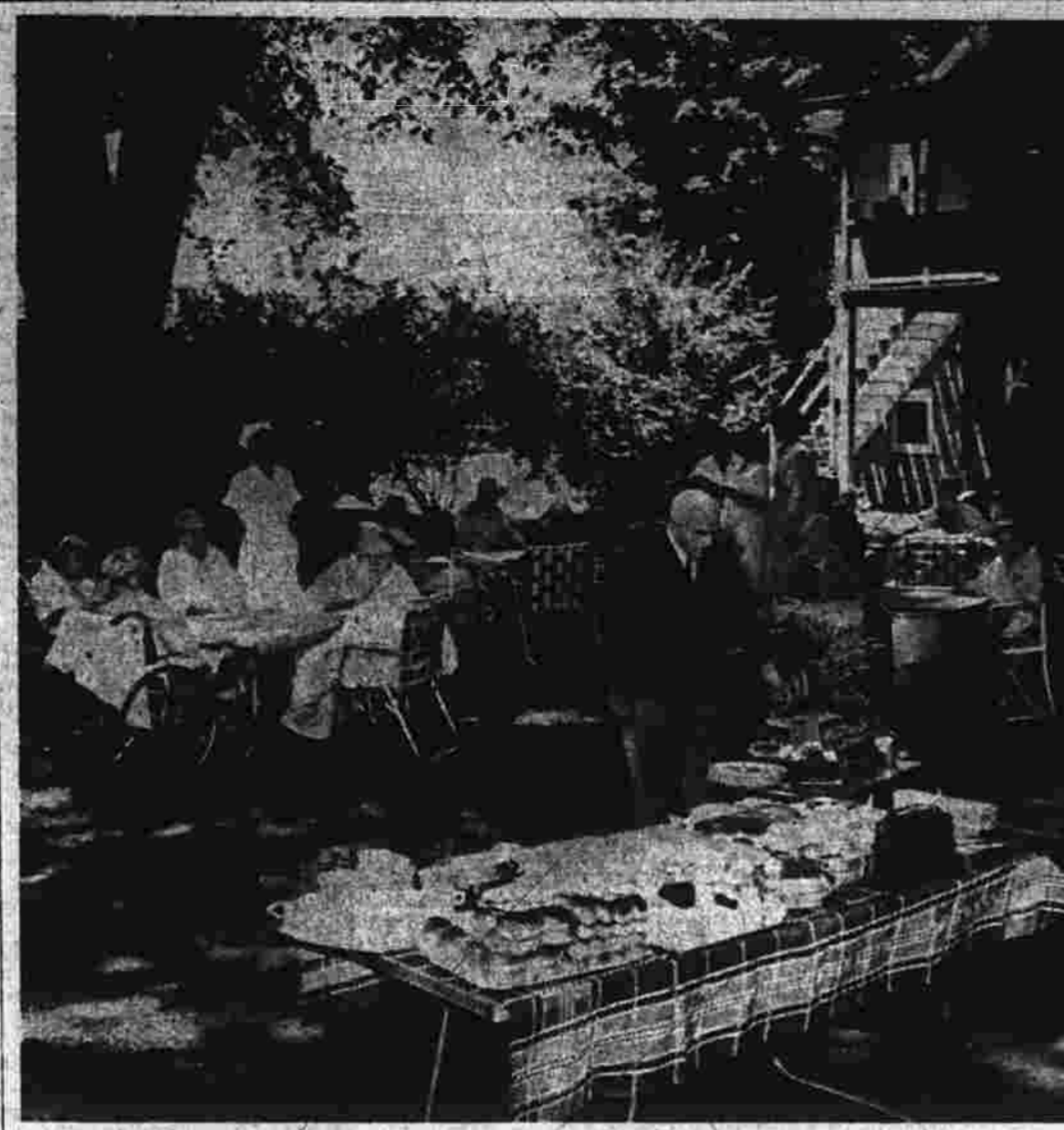
Get 'Em While They're Hot Get a grill, get a chef, and someone to lead group singing and youngsters of any age will have a good time.

(Continued From Page One) Ribicoff said that he would call upon opposing candidates for state legislative posts to support safety measures as above partisan politics.