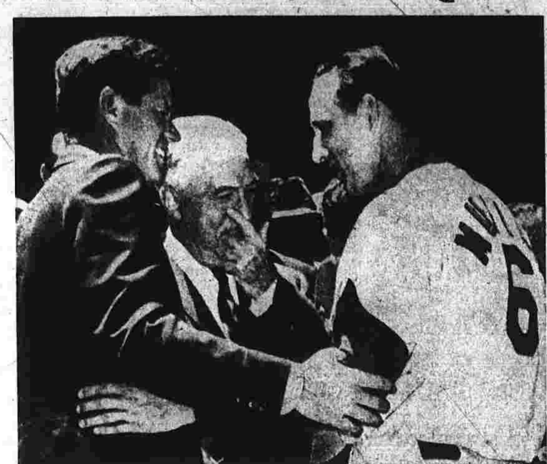
EXCHANGE OF SHAKES—President Kennedy shakes hands with Stan Musial, Sr. Louis Cardinal veteran, before the start of All-Star game. Center is Baseball Commissioner Fred Frick.